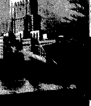
The new medical center towers majestically above the East River.

A mammoth dial private telephone exchange interconnecting the approximately 1,000 telephones provides service for the administration, the numerous hospital and medical school units, the nurses' home and manual room service for private patients. Space is provided, moreover, for possible enlargement of the exchange to accommodate 1,900 telephones when such expansion becomes necessary.