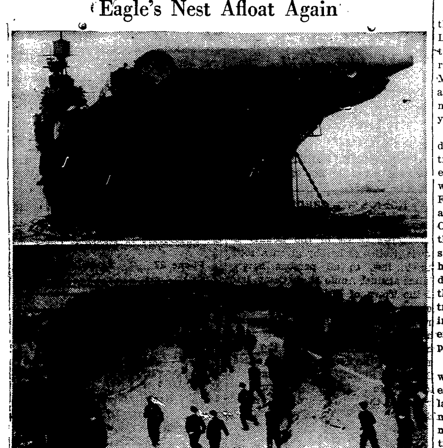
The British aircraft carrier Illustrious which was damaged in a sea battle is now in service again, after having been repaired and refitted at an American shipyard. Photo at top shows the ship as she rides at anchor at a British port. Bottom photo shows crew members of the Illustrious running to their stations as an alert is sounded.

The next social evening will be held on Friday evening, Sept. 4.