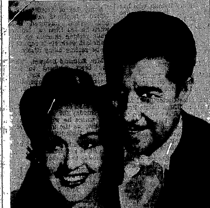
Don Ameche and Betty Grable who co-star in "Moon Over Miami" which appears at the Capitol Theater Sunday, Monday and Tuesday.