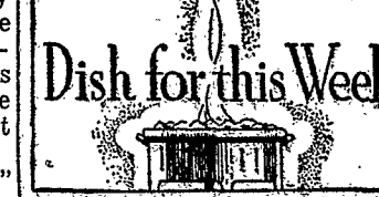
Dish for this Week

Camilla, Hassan said. "I'm sorry," she repeated frowning, "but I can't marry you, Hassan."