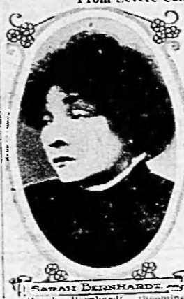
SARAH BERNHARDT, the eminent French actress, is confined to her bed at her home in Paris. It is reported that the seventy-five-year-old marvel is suffering from a severe cold in the chest. In all likelihood Madame Bernhardt will be forced to abandon her proposed trip to the United States.