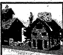
Ornate bird house replicas of homes, barns and stations usually wind up as home decoration.

Paintings, sculpture, jewelry, weavings and sundry other talents rounded out the display.