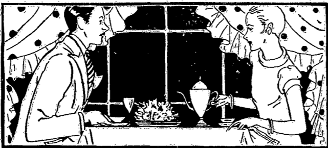
By JOSEPHINE GIBSON Director, Heinz Food Institute

THE breakfast menu is usually more difficult to vary than that of other meals. It is easy to serve the same foods over and over again, but who wouldn't dread breakfast if they knew that every day they would see at the breakfast table exactly what was there yesterday? Fruits, cereals, breadstuffs and hot dishes should be varied. Be sure to utilize seasonable fruits and change the menu to appeal to appetites of various seasons. Spring and summer breakfasts may be especially interesting for there is a wealth of appropriate foods from which to choose. The following menus furnish interesting, well-balanced breakfasts: