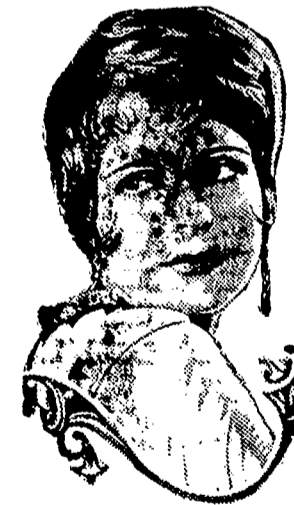
Clara Bow in The Paramount Picture "It"