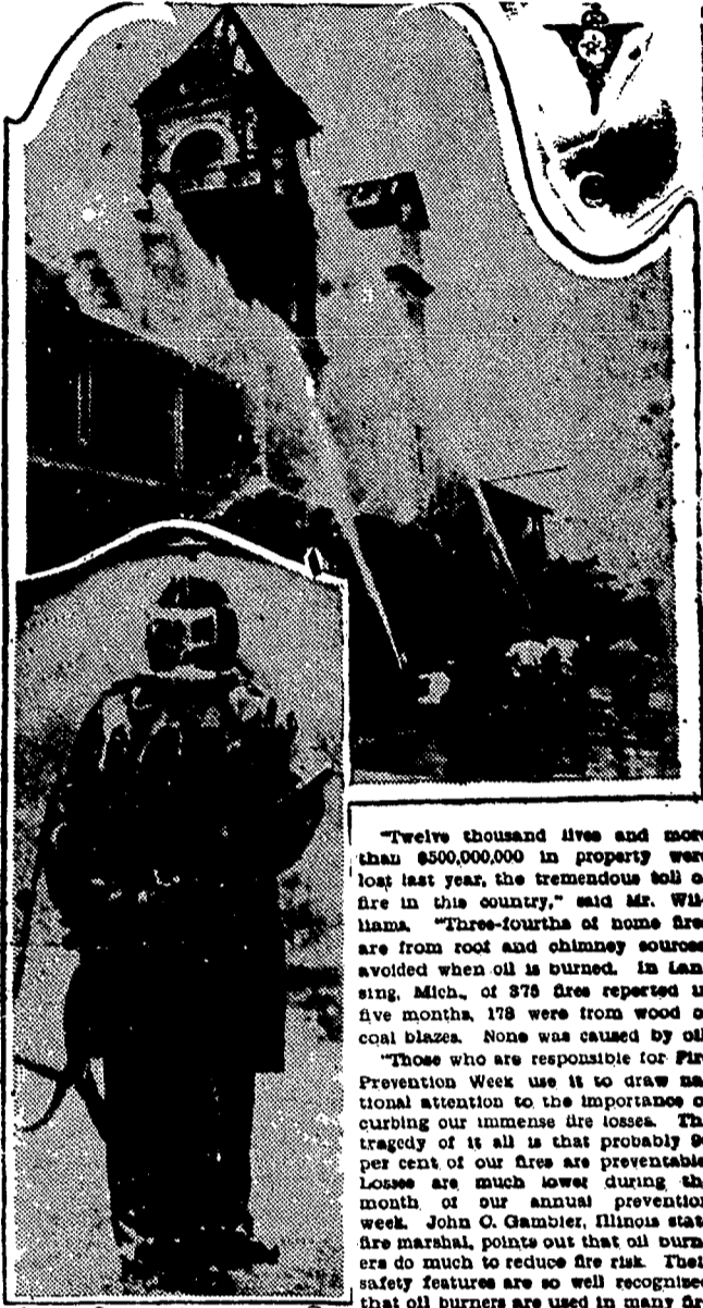
AID TO SMOKE-EATERS

I don't know yet What school's all about. But I'll just sit still And puzzle it out.