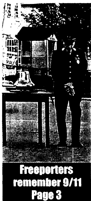
Freeporters remember 9/11 Page 3