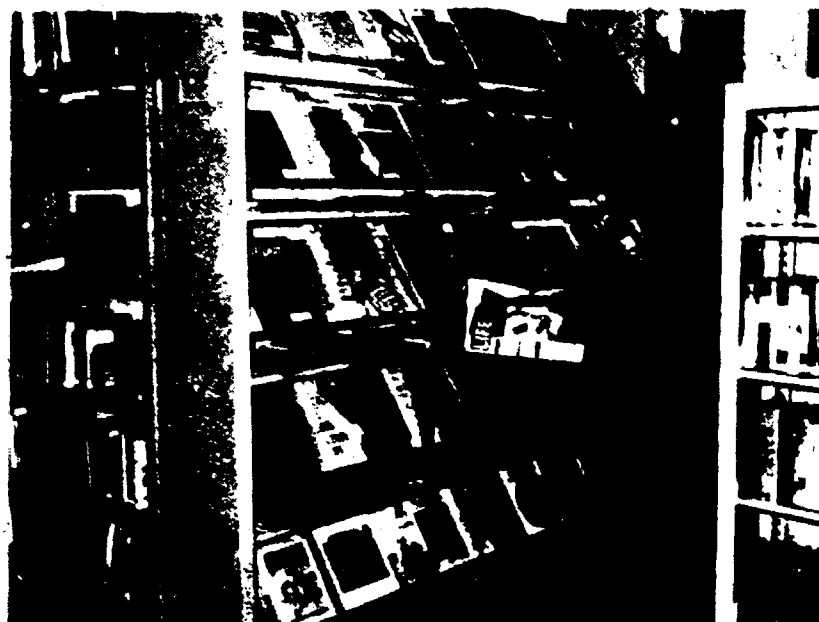
THE MAGAZINE AND PERIODICAL section of the library is well stocked, and is conveniently located near a comfortable reading nook.