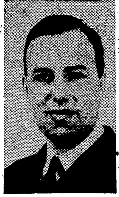
ZONING BOARD of Appeals

HAYDEN, STONE & CO. Members New York Stock Exchange White Plains Office 55 Church Street White Plains 9-2500