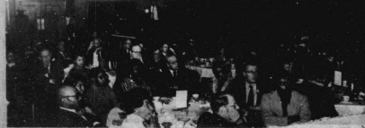
Identify 15 individuals in accompanying photos for $5.00 prize.