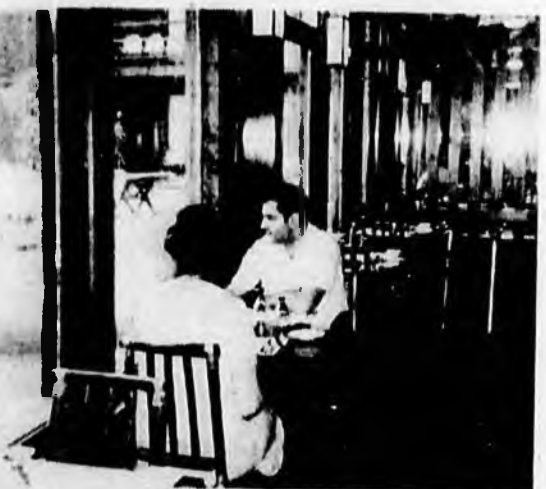
Birdcages and Gates decorates the Terrace Room overlooking the Pool