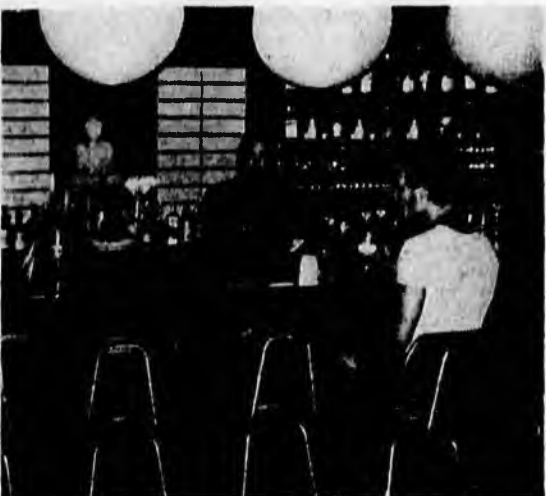
Samurai Bar and Cocktail Lounge features Computer Bar