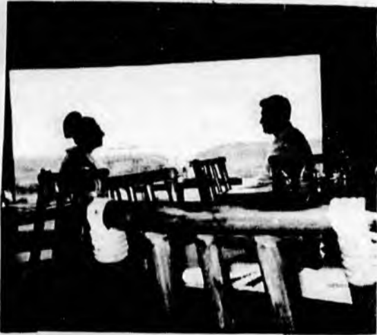
Oceanview Dining in the Red Room