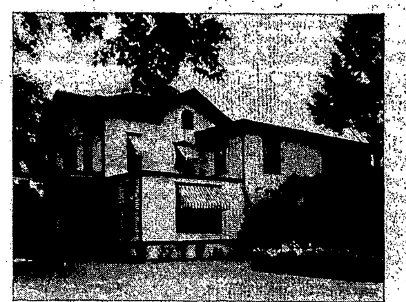
Residence Funeral Home 124 West Miller St.

One favorite way to prepare a crunchy sandwich shredded raw carrot is in a gel-made with shredded carrots, atin salad in combination with chopped peanuts, and salad pineapple or orange. Another is dressing.