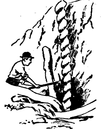
GIANT DEVIL'S CORKSCREW, EIGHT FEET HIGH, DISCOVERED AT PINE RIDGE.