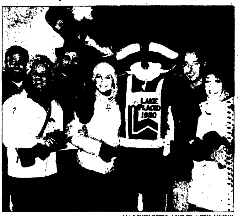
Roni Raccoon, center, made appearances and mingled with revelers throughout the 25th anniversary festivities.