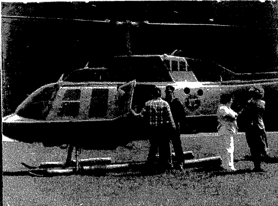
Students and teachers got a good look at the New York State Police Aviation Department's helicopter when it 'dropped in' at the Pulaski High School on May 7. The visit was part of an informational program that included an assembly.