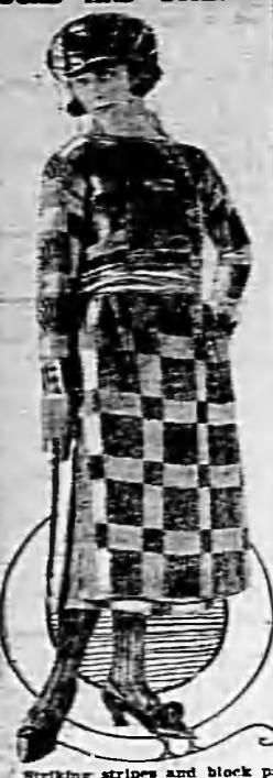
Working stripes and block patterns seem to have taken a firm hold, both here and in Paris. Here is a Paris dress of deep color and blue, a beautiful and elegant block weave and built quite on military lines, with the bodice buttoned up one side, the skirt straight, sleeves trim, and long, close fitting, and buttoned at the wrist.

"Lingerie shall cost much and be little," is the slogan of the inner garment makers. They say that the fitted lines of outer apparel make this shortage of inner material a necessity, and that since "lingerie" shall be largely absent, what remains shall atone in beauty and richness. Negligees are the most popular of all lingerie. Good taste faces no limits to the money that can be lavished on these boudoir confidantes. A leading house shows a model of heavy, lustrous peach