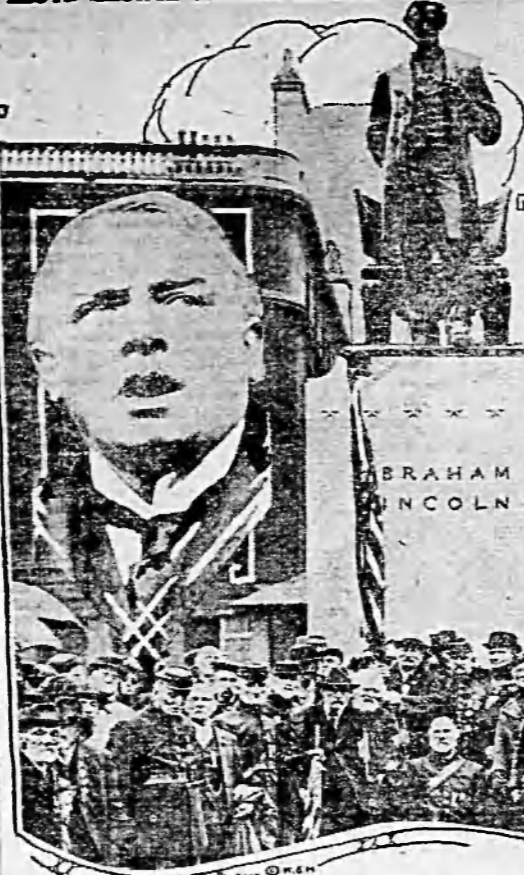
LONDON—Premier Lloyd George made the principal address at the unveiling of the statue of Abraham Lincoln at Westminster. The statue was a gift to Great Britain from America. Veterans of the U. S. Civil War, shown at the base of the statue, took part in the ceremony. Lloyd George is shown singing "The Star Spangled Banner."