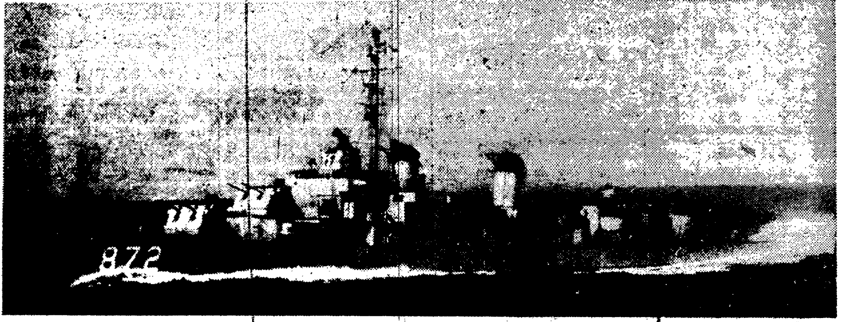
ONE OF MANY DESTROYERS IN FLEET. This is the USS Forrest Royal, one of numerous destroyers which will use the St. Lawrence Seaway in their cruise to the Great Lakes on Operation Inland Seas. The ship is a 3,540 ton ship carrying a crew of 15 officers and 200