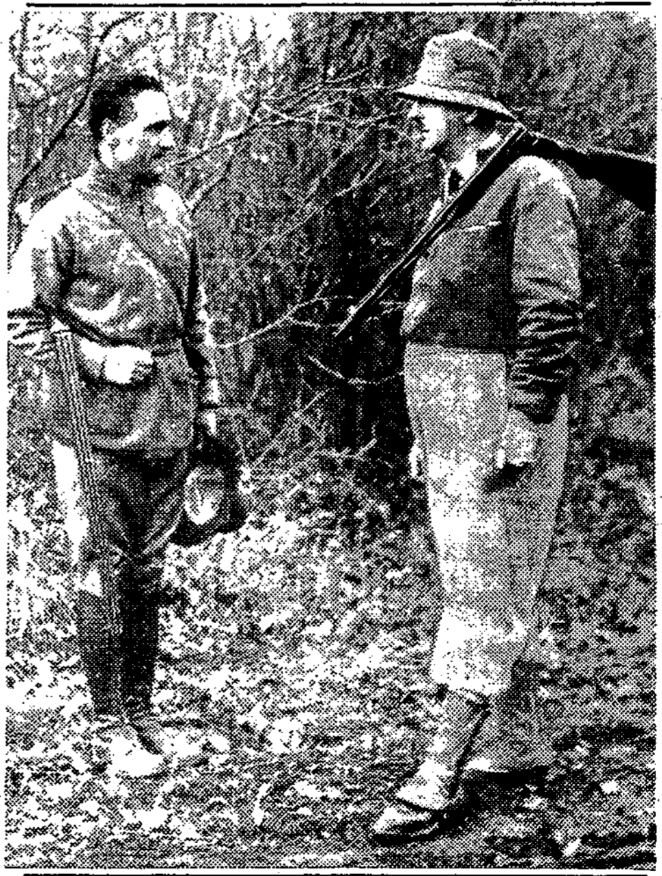
NO CARES FOR HIM —While heads of other nations worry over the trend of events, King Carol of Roumania, right, indulges in his penchant for hunting. He is pictured, near Gherghita, Roumania, with gun over shoulder, conferring with one of his gun bearers.