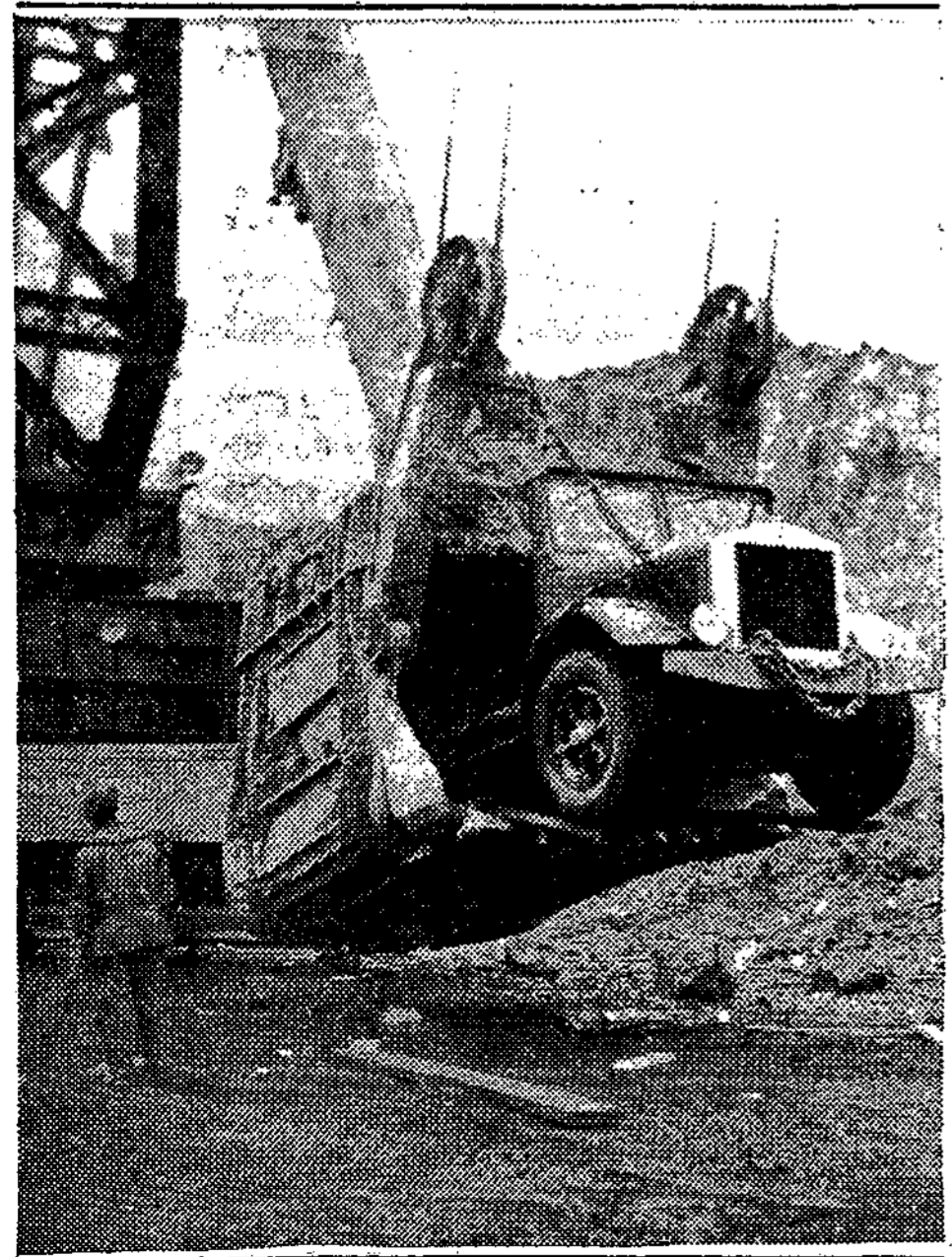
LARGEST DIPPER —The world's largest dipper, on the world's largest strip shovel, in the world's largest strip coal mine, at Seelyville, Ind., lifts the world's largest coal truck with ease. The shovel was built in Cleveland. The dipper is capable of lifting 110,000 pounds of dirt at one scoop—or 2,000 to 3,000 cubic yards an hour.