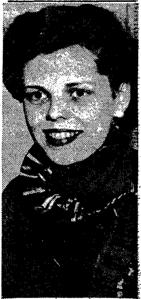
SHE'LL WED YOU IF YOU MAKE $50 A WEEK —This New York girl, assuming the fictitious name of "June Marshall", will marry you if you are not more than 35 years of age and if you make at least $50 a week. And, oh, yes, you must not have red hair. "June", an orphan, is out of work and is looking for a man to lift her, a mother and a grand mother "out of straitened circumstances."