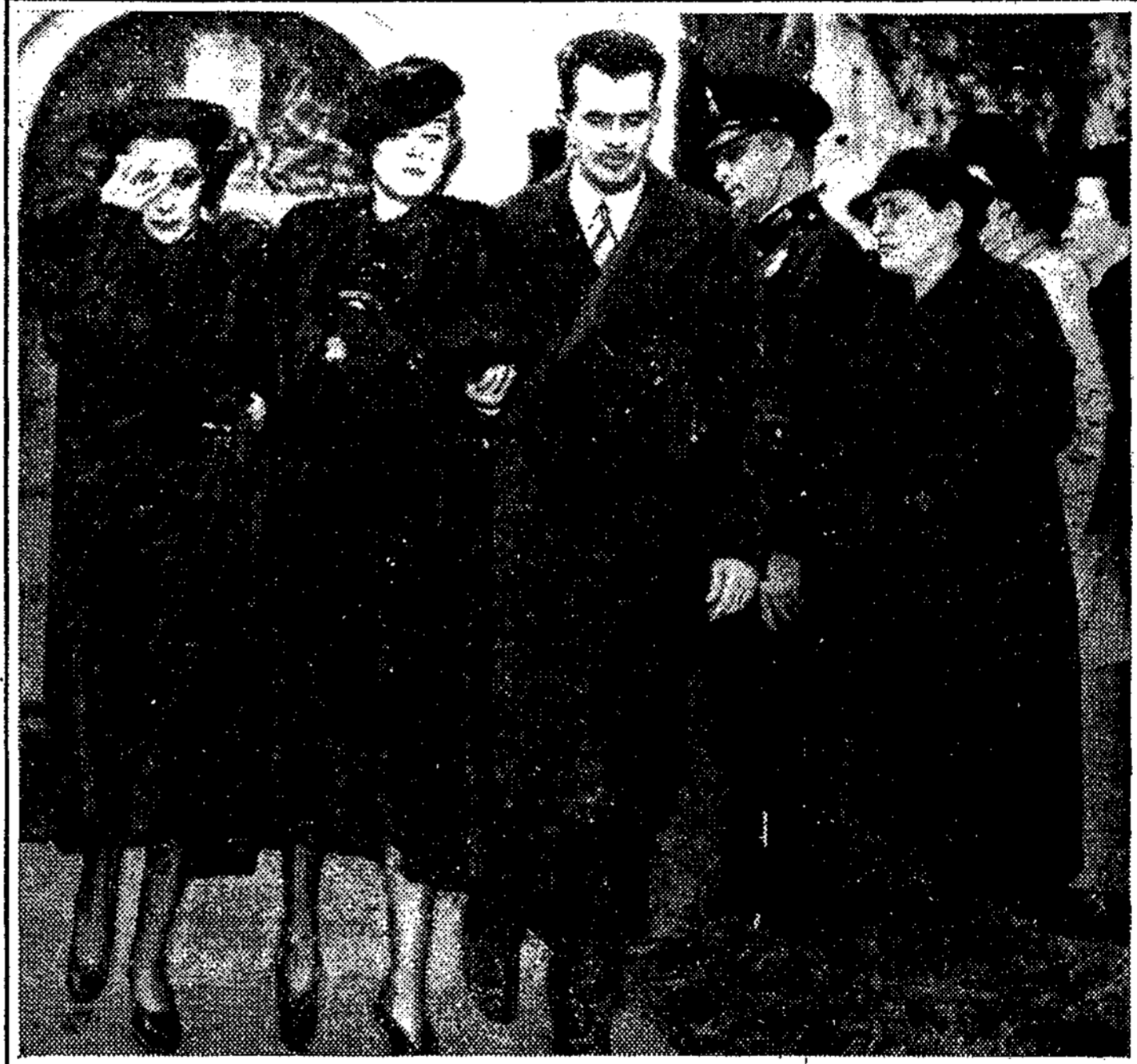
AT JOHN GILBERT FUNERAL —Marlene Dietrich, center, who had been seen often with John Gilbert lately, is pictured attending funeral services for the movie star in Hollywood. She is accompanied by Dolores Del Rio and Dolores' husband, Cedric Gibbons, noted film-art director.