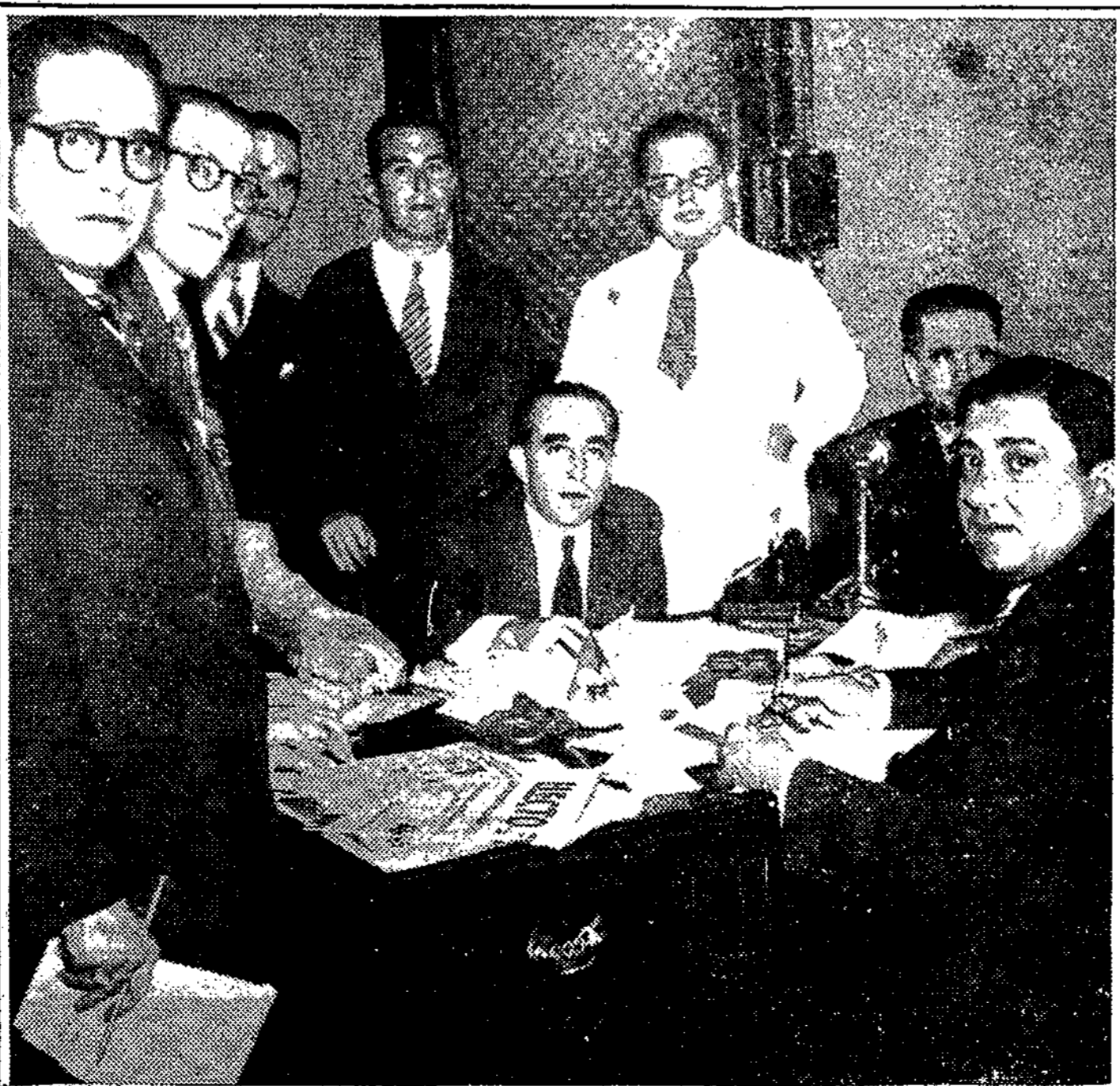
WINS PRESIDENCY IN CUBA —Dr. Miguel Mariano Gomez, center, sits with his staff in his political headquarters in Havana and tabulates returns which indicate his election as president of Cuba.