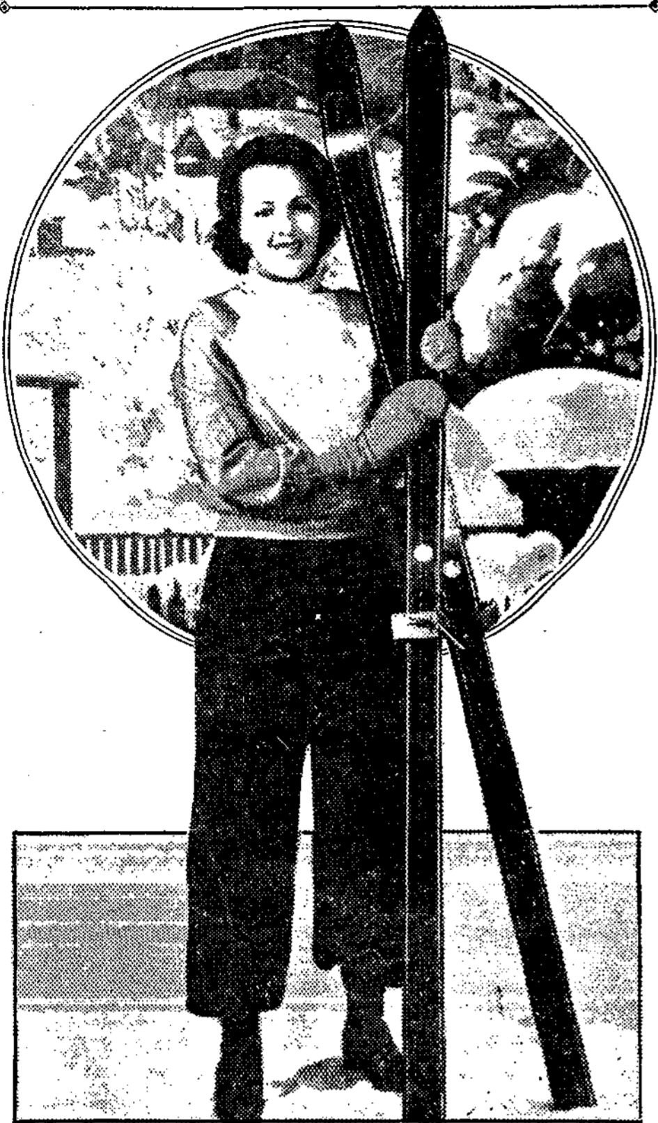
FOR WINTER SPORTSWOMAN —If you are a woman and you like to ski, take a tip from Ruby Keeler, movie dancer, who says this ski outfit is just the thing.