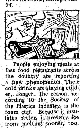
People enjoying meals at fast food restaurants across the country are reporting a new phenomenon. Their cold drinks are staying colder, longer. The reason, according to the Society of the Plastics Industry, is the foam cup. Because it insulates better, it prevents ice from melting sooner, too.