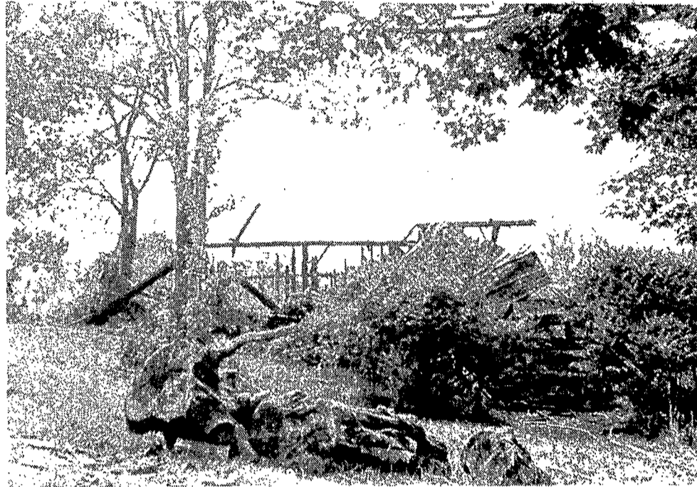
BARN STRUCK BY LIGHTNING—Lacona Firemen are shown securing their equipment after dousing a re-kindling late Saturday morning, September 10th, of the barn fire on the David Corse property, Center Road, Town of Sandy Creek. The fire was started about 1:45 a.m. that morning, when lightning hit the structure during an electrical storm. The building and contents were destroyed in the blaze.