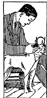
Having Such a Good Time.

Small Edna—It must seem like heaven to you here on earth, doesn't it, auntie?