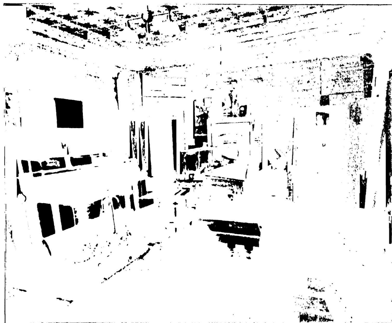
INTERIOR OF FRUITATIVES OFFICE.

of bile, and this bile acted on the intestines and produced a purgative or aperient action. Also it acted on the kidneys and it was a distinct and decided diuretic, or kidney stimulant, and produced more action on the part of the kidneys, that is, it increased the flow of urine and it increased the solids of the urine as well as the liquids. It was, in other words, a decided kidney stimulant, or true diuretic. Also, it was found that it acted on the glandular system of the body, and that this action was most pronounced on the glands of the skin, and it increased the flow of perspiration, or the skin action, very materially. It increased the action of all the glands of the body, and it was found to be a decided glandular stimulant. In these experiments only freshly expressed juice, that is, juice of fresh fruit, freshly expressed, was used, and it was found that if the juice was not fresh the same action would not occur.