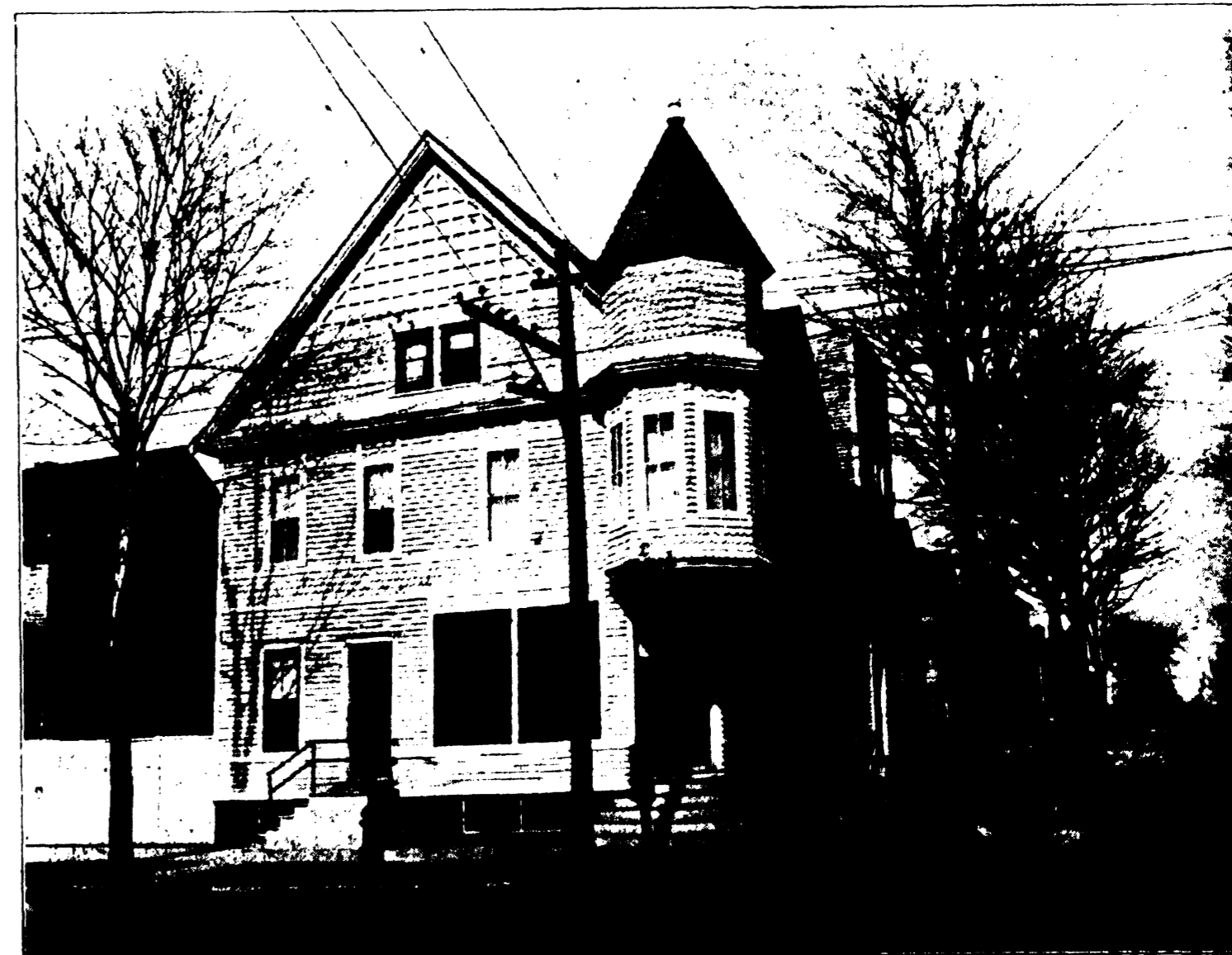
OGDENSBURG PLANT OF FRUITATIVES, LTD.