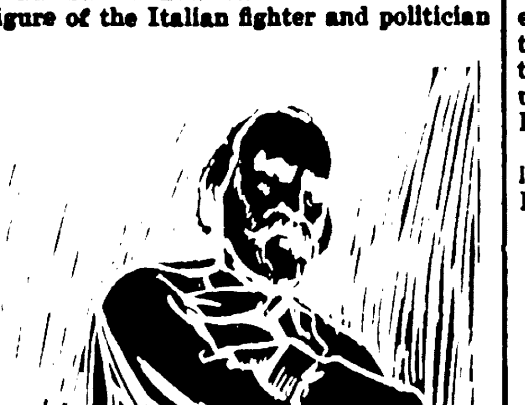
CHICAGO MONUMENT TO GARIBALDI.

Chicago will soon have added to its artistic properties a statue of Garibaldi, the great Italian patriot.