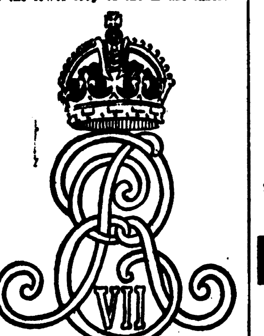
KING EDWARD'S ROYAL CIPHER.

King Edward VII of England has just selected his royal cipher. This is to be worn on badges, buttons, etc., in the British army, navy, civil service and everywhere else that it is needed to denote that the wearer or user is a "servant of the crown."