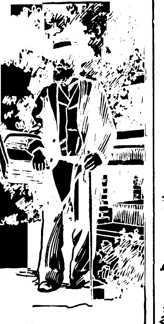
JOHN HOWARD PAYNE'S OLD BODY SERVANT.