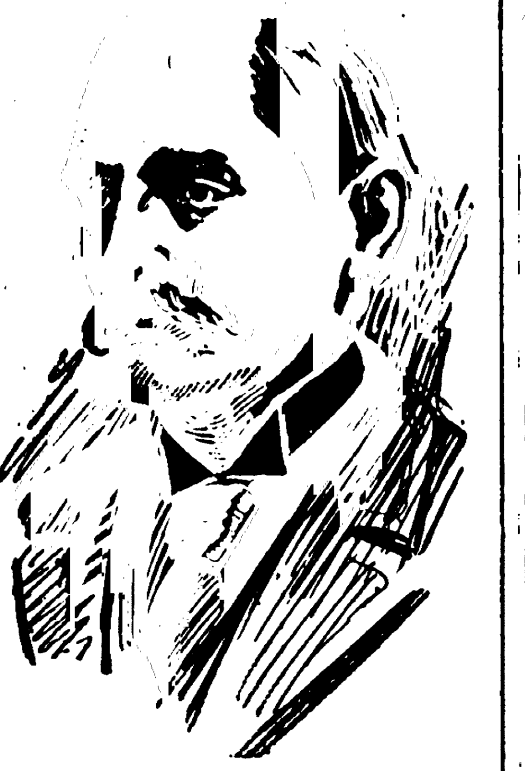
TOMAS ESTRADA PALMA.

"There are three candidates for the presidency of Cuba libre," said General Maximo Gomez during his recent visit to the United States.