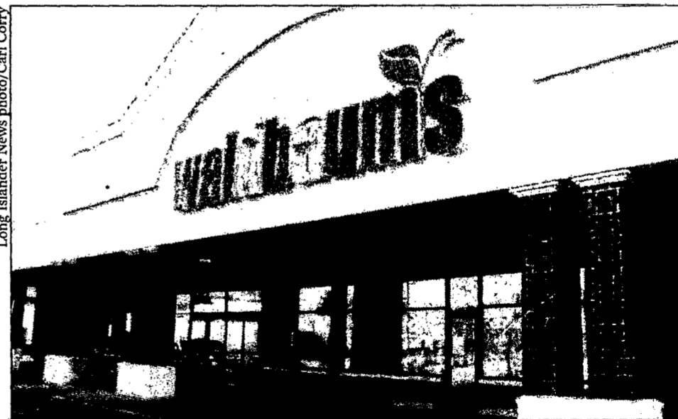
The site of the now-defunct Waldbaum’s may soon be replaced by a new grocery store from the owner of the local grocery chain, Southdown Marketplace.