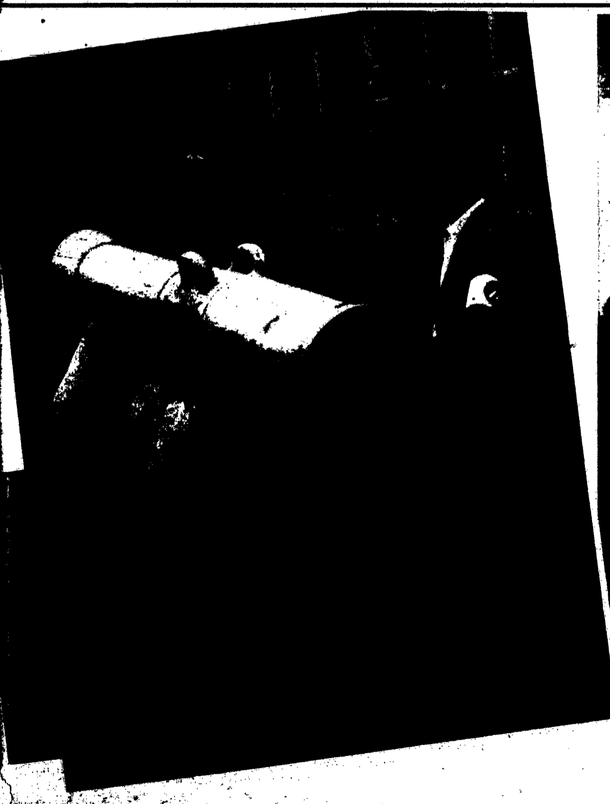
Modern dance classes are taught as a part of the regular freshman course at Mines. Three national sororities have built lodges for members on the campus, unusual, as this is the nation's only mining school to admit co-eds.