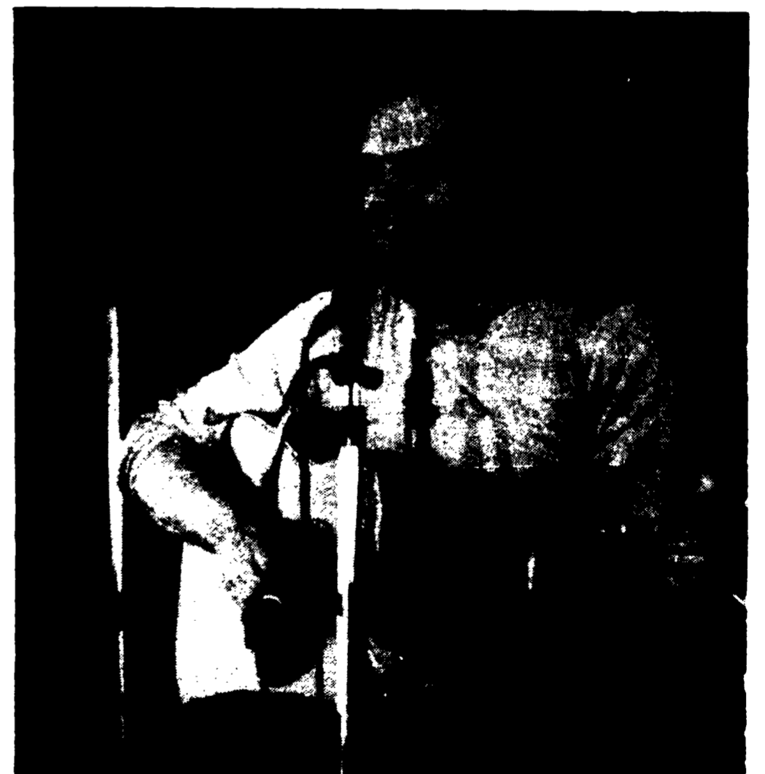
Harry Chapin drove his "Taxi" into Geneseo State's College Union Ballroom. He was just one of many top performers who appeared last year on campus.

--needs good workers. If your major is not one of the fine arts--great! All the more time for us.