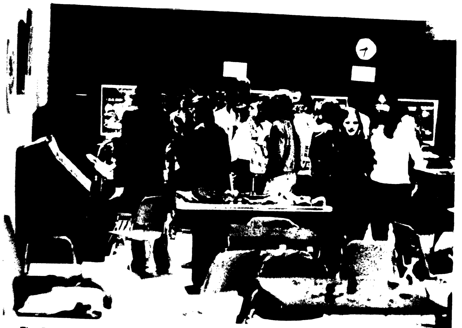
The Recreation Room (downstairs in the College Union) was kept busy throughout the last year with tournament after tournament designed for those whose taste runs to pinball games, ping-pong, pool and football.