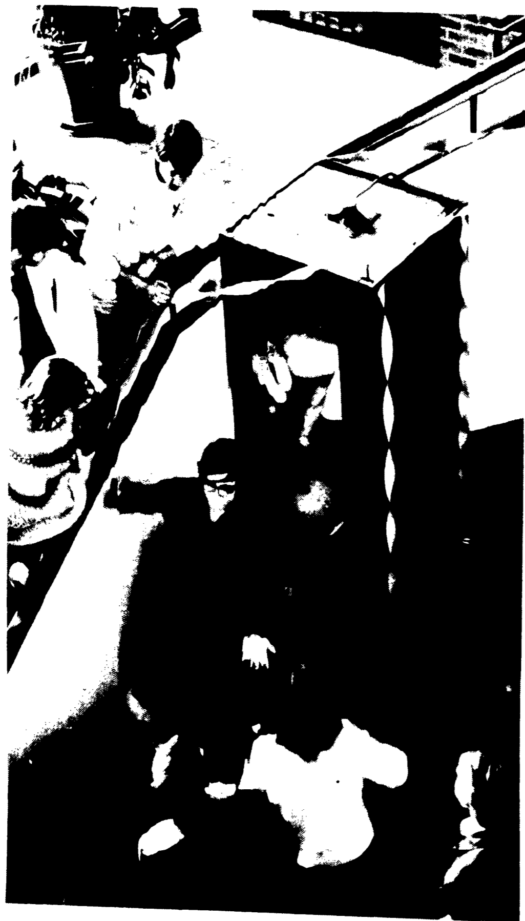
"Number, please!" Just how many fully-grown college students can be fit into a telephone booth. The answer was determined during last year's Homecoming Weekend. There's no booth-stuffing this year, but plenty more action, including a sky-diving exhibition.