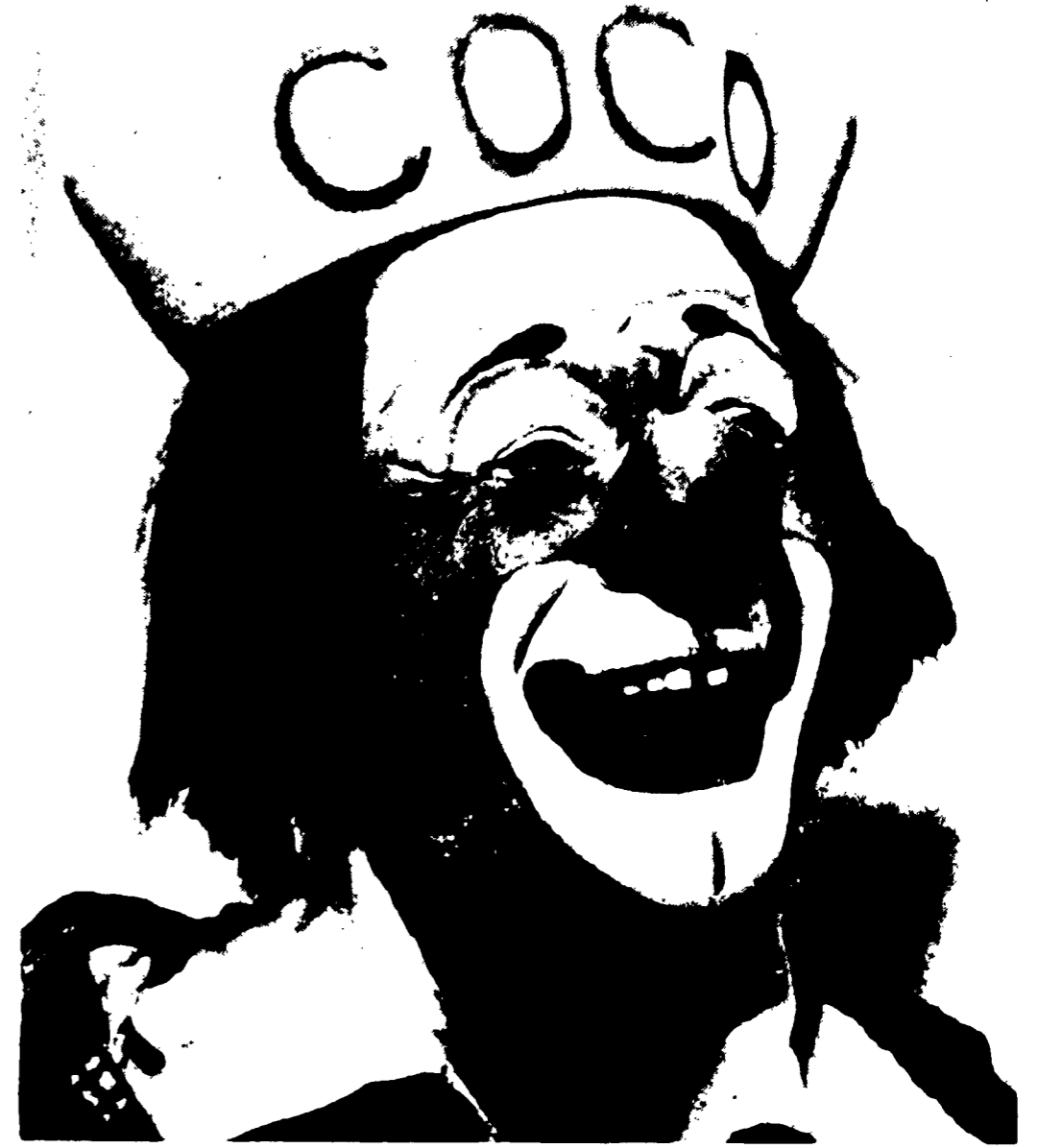
COCO THE CLOWN will appear with the Hanneford Circus during Homecoming this year.